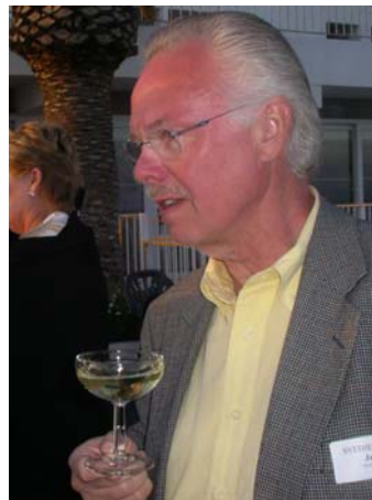
After mingling and bubbling it was time for dinner and dance.