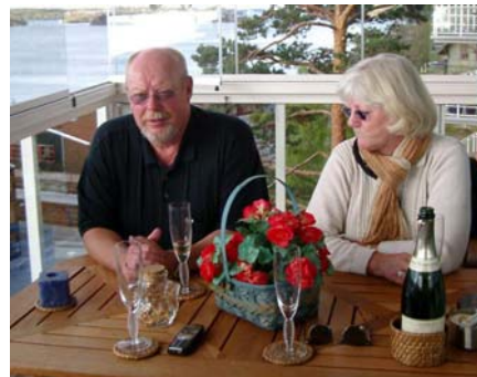
At Westerlund's terrace