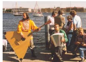
Head of the monk's navy at Wallamo in Ladoga and musicians at a party in St Petersburg, Russia. Our yachts in the background