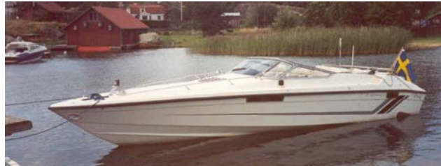
The speedy boat at rest