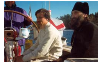
The father and his colleague onboard s/y Vita Brevis at Wallamo, Russia