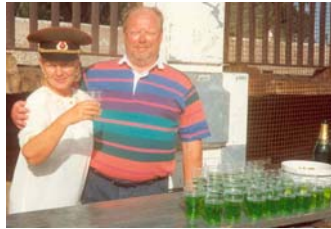
First visit to Russia under sail. Big party in Vyborg – no one will forget that they don't remember.