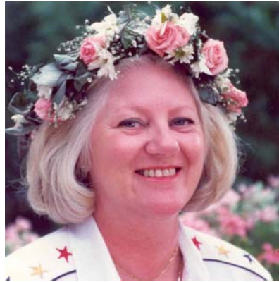
Laila becomes evenly older the same year.