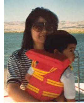
We went up the Saratoga river with their motorboat.