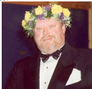
Birthday Child in all his lustre